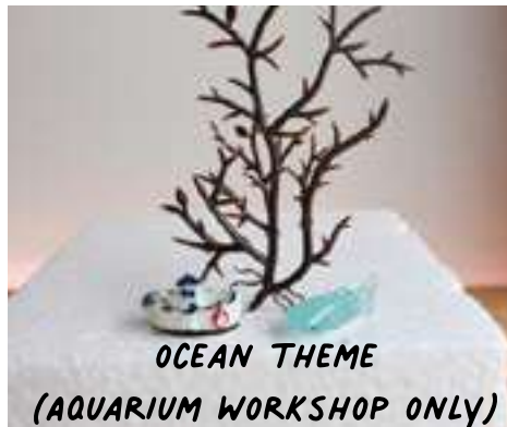
OCEAN THEME (AQUARIUM WORKSHOP ONLY)

Figurines pack include: 1 random house figurine (prem) (yellow/beige/blue/pink) 2 random garden themed figurines (econ) (red mushroom/bird/tortoise/mini round tree/orange bridge..)