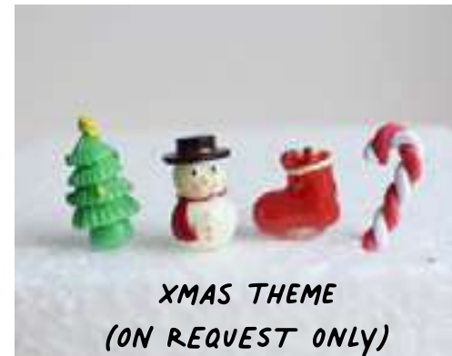
XMAS THEME (ON REQUEST ONLY)

Figurines pack include: 1 brown plastic seafan (premium) 2 random ocean themed figurines (econ) (boat/whale/treasure chest/buoy/ coconut tree/orange bridge/red star- fish/anchor/blue sealion/tortoise/ ocean fish/stingray/shark..)