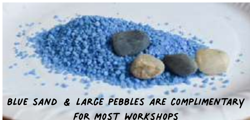
BLUE SAND & LARGE PEBBLES ARE COMPLIMENTARY FOR MOST WORKSHOPS

Figurines pack include: 4 random xmas-themed figurines (econ) (candy cane/xmas tree/santa claus/ xmas sock/snowman/xmas bell)